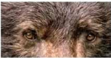
Bears Matter Month 'Life through their eyes' Feb 14 th - Mar 26 th 2017

The biggest event in our fundraising calendar 'Bears Matter Month' this year ran from February 14 th to March 26 th . Traditionally we run this from Valentines day to Mothers day and sometimes this is longer than a month.