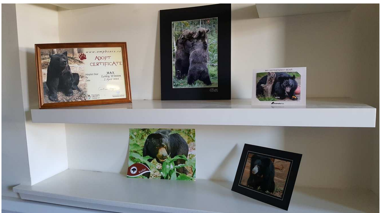
Our lovely little orphanage - Max, Bodo, Fluffy and Scruffy, Chitra and Kudat