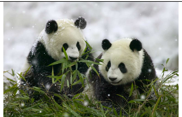
Panda conservation... It is definitely not black and white.

With only one unsuccessful attempt at returning a captive bred panda to the wild, the ongoing destruction of their habitat and breeding programs in China 'renting' pandas to zoos around the world for millions of dollars, the issue of keeping this mesmerizing bear from becoming extinct, is far more complex than simply trying to get them to breed.