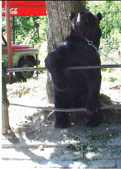
Max, before rescue