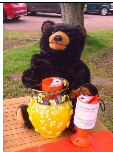
Our new mascot 'George'

Strawberry Corner Garden Centre near Wallyford (who very kindly donated our 'Honey Pot') have let us hold a number of fund and awareness raising stalls on their premises since the Spring. Despite cold and windy days, these stalls have brought in just under £200 to date and will continue throughout the summer.