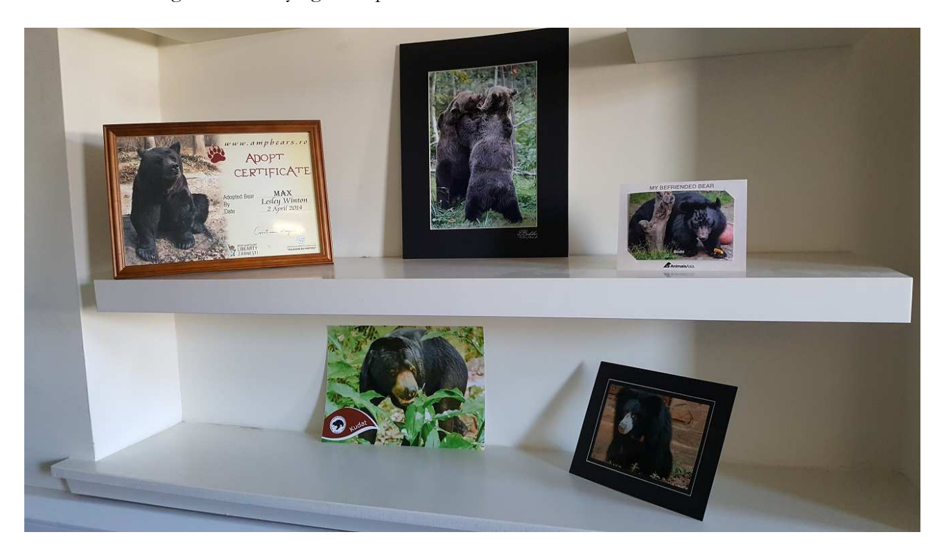
Our lovely little orphanage - from left to right: Max, Fluffy and Scruffy, Bodo, Kudat and Chitra

The Winton Bear Foundation's little orphanage is growing rapidly! We have decided to 'adopt' a different species of bear from organisations that are currently beneficiaries. This way, this allows us to support their work and also raise awareness of each species of bear and the threats they face. To date we have six adoptees, Fluffy and Scruffy at Wildwood Trust, Bodo (Animals Asia), Max (Libearty Sanctuary) Chitra (International Animal Rescue and Wildlife SOS at the Bannerghatta Bear Rescue Centre in India) and Kudat (Bornean Sun Bear Conservation Centre). We will renew each of our adoptions on an annual basis, helping to raise awareness of the dreadful conditions many bears are rescued from and the organisations trying to help them.