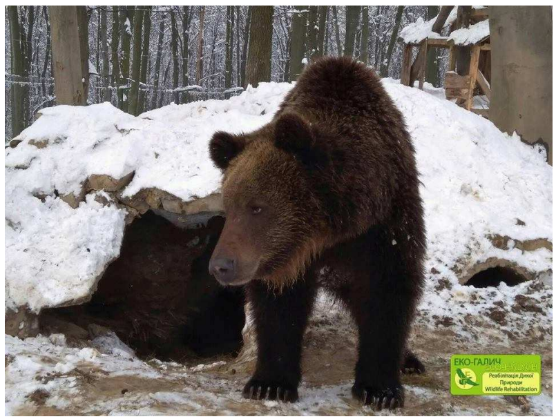
Myr, one of the bears at Eco-Halych