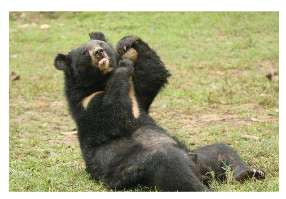
Mine, all mine – one of the bears enjoying their coconut.

Bear lovers will recall with great sadness the threatened eviction of 104 of Animals Asia's beloved rescued bears from their Vietnam sanctuary at the end of 2012. Following the wonderful news that the eviction was overturned, we at the Winton Bear Foundation decided to buy a coconut for each and every bear in the sanctuary, as a special treat so that they could celebrate staying in their new home. We started a tradition in January 2013, and have been sending funds for this annual treat ever since.