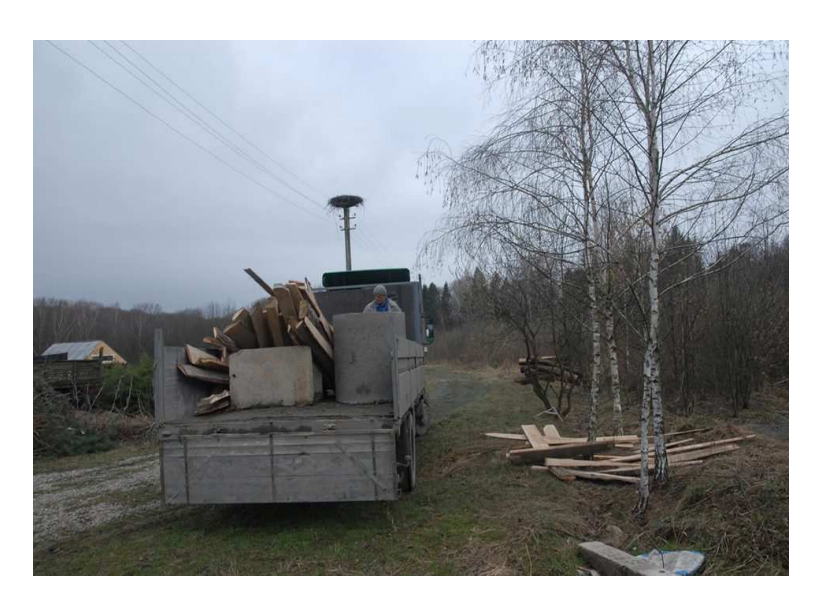
Unloading materials to build enrichment facilities – Photo courtesy of Eco-Halych

https://www.facebook.com/EcoHalychWildlifeRehab/