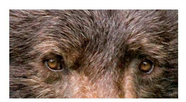
Bears Matter Month 'Life through their eyes'