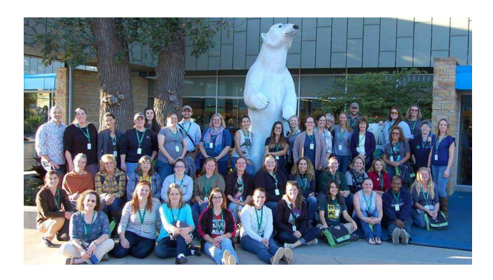
ABC Delegates Omaha 2016

Bear Care-Givers around the world to come together to share knowledge and expertise. The conference in 2016 was held in Omaha, USA and we sponsored a coffee break during the conference, to encourage others to chat informally amongst themselves about their work. In future years we hope to sponsor delegates from developing countries, or those involved in WBF funded work.